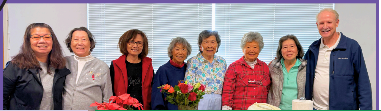
JEC Sisters Group Christmas Gathering

14614 Magnolia Street Westminster, CA 92683 (714) 893-5500 | JourneyEC.org A member of EFCA | efca.org