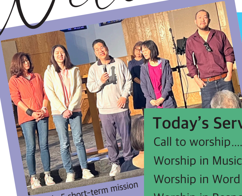
Orlando 5 short-term mission commissioning.

Visit our website | Staff, Elders, Deacons, and more information.