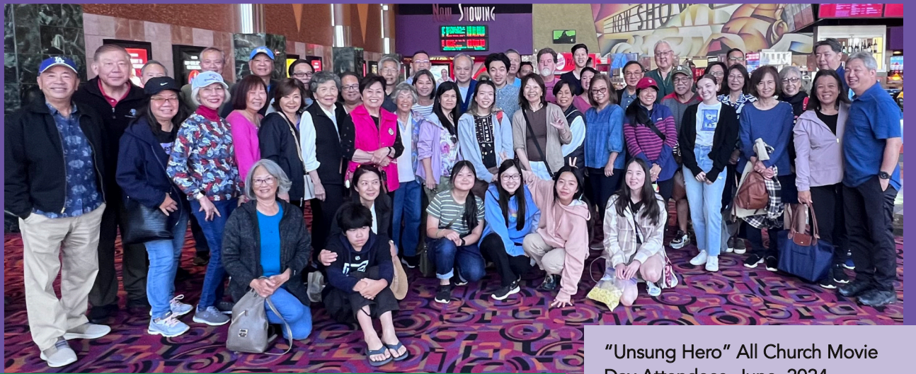
"Unsung Hero" All Church Movie Day Attendees. June, 2024