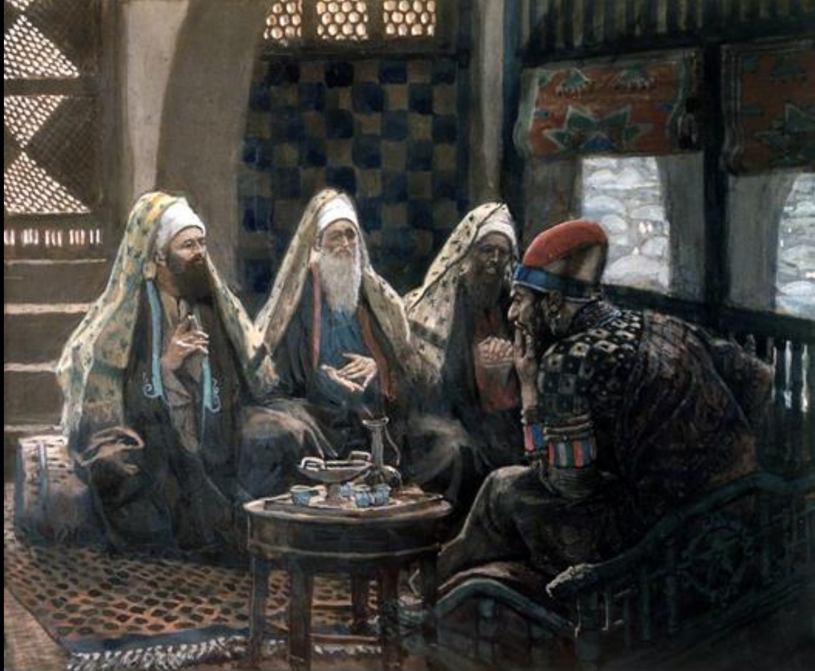
The Magi in the House of Herod by James Tissot

King Herod: From Insecurity to Jealousy to Murder